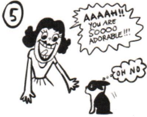
DON'T Squeal or shout in his face