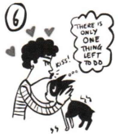
DON'T Grab his head and kiss it (This is an invasion of space)

Doing this to a dog who doesn't know you is like a perfect stranger giving you a great big hug and kiss in an elevator. Wouldn't that creep you out? And wouldn't you have the right to defend yourself?