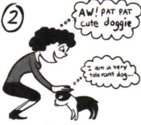
DON'T Lean over the dog & stick your hand on top of his head