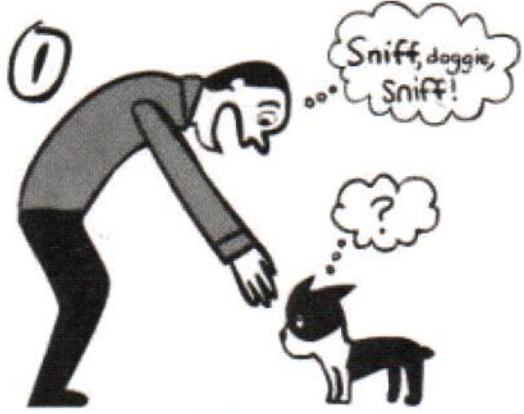
DON'T Lean over the dog & stick your hand in his face

Most people do this stuff and it stresses dogs out so they BITE! I don't care how cute you (or your kid) think Boogie is. Please show him some respect.