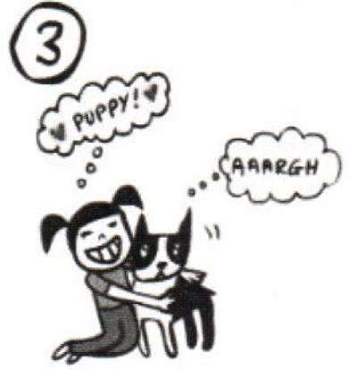
DON'T Grab or Hug him