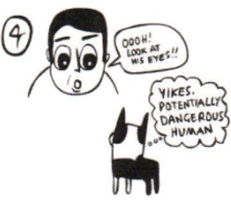
DON'T Stare him in the eye (This is an adversarial gesture)